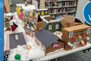
Vermilion Winter Village