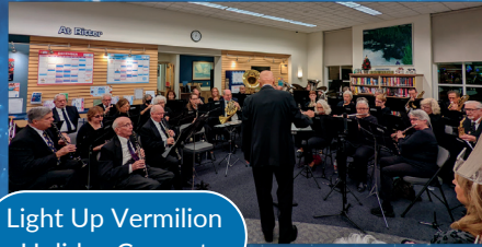
Light Up Vermilion Holiday Concert

Due to limited supplies, a limited number of test kits will be distributed per person. Library staff are not medical professionals and cannot provide medical advice or assistance with administering tests.