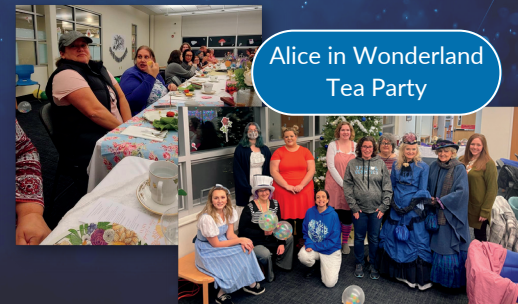
Alice in Wonderland Tea Party