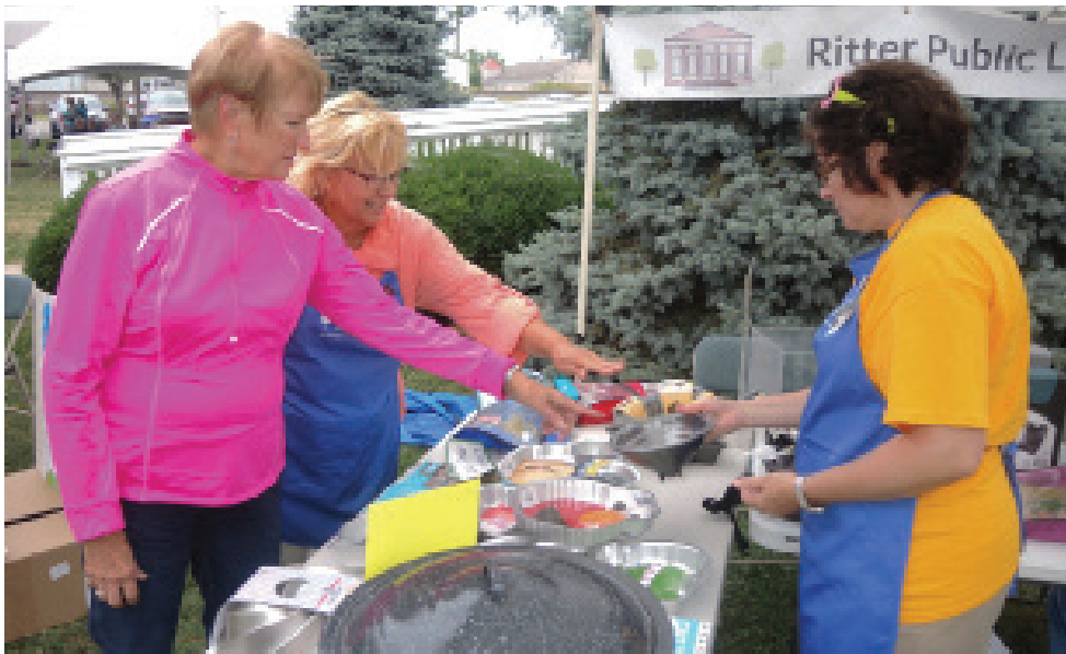
Ritter staff show off some of the new items available to borrow from the library.

table. Borrow the tool kit or take home the button-maker or the Go-Pro camera. You can use the film and slide scanner to digitize your old photos.