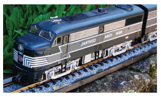
See the model trains on the second floor above the magazine shelves.

Find more local history on the Stories of Vermilion page at www.ritterpubliclibrary. org. And check the online calendar for our series of live interviews with longtime residents, sponsored in partnership with the Vermilion Area Archival Society and the Vermilion History Museum.