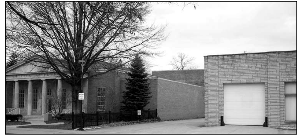
This view of the east side of the library shows where possible expansion could take place if the old car dealership next door were razed.

at our financial resources and the needs of the community to try to come together on a vision for the future," said Jim Liljegren, president of the board.